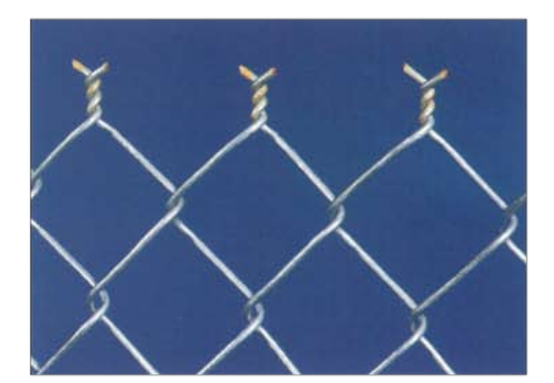
Pre-coated fabric with uncoated tips. With pre-coated fabric, some manufacturers coat the bare ends, but many don't. No one coats the ends with the same material that protects the rest of the fabric.