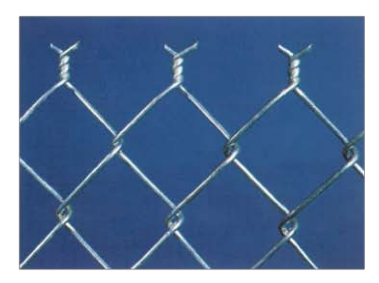
GAW fabric. The GAW process guarantees that cut ends will be coated with the same quality material and protection as the rest of the fabric. The pre-coated process provides no such guarantee.