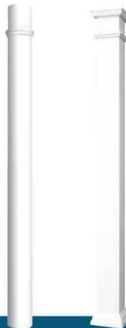
Round Straight 8" Square 8"